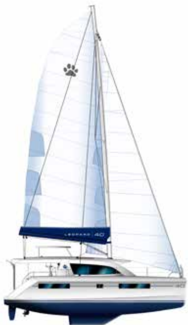
LEOPARD | 40