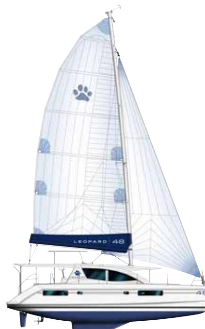
LEOPARD | 48