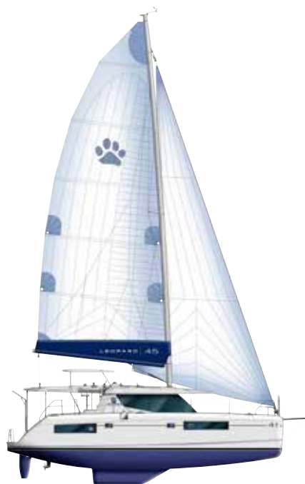
LEOPARD | 45