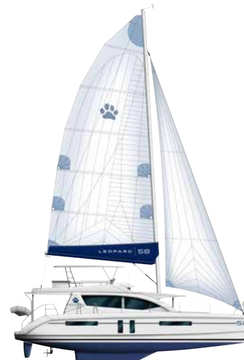
LEOPARD | 58