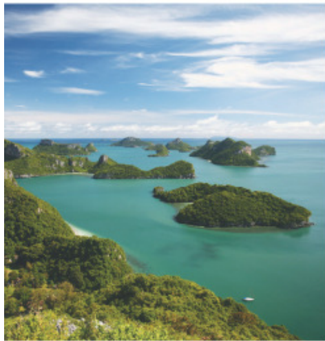
Koh Samui National Park