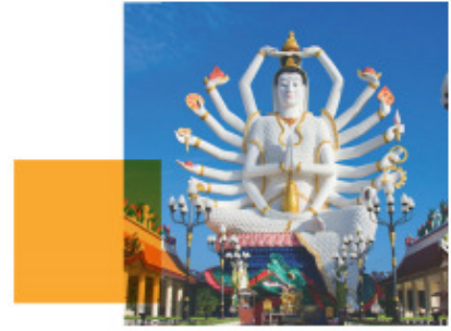
Statue of Shiv

Koh Samui rapidly evolved from a hipster's hangout to a first-rate holiday destination with many bungalows, hotels and top resorts. For the sailor, it's still easy to escape the crowds in this top location and make the most of the dry season in the stunning Gulf of Thailand.